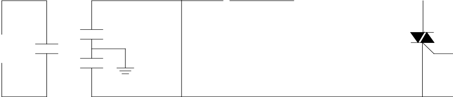
FIG.8 ÖTest circuit for inductive and resistive loads to IEC-61000-4-5 standards