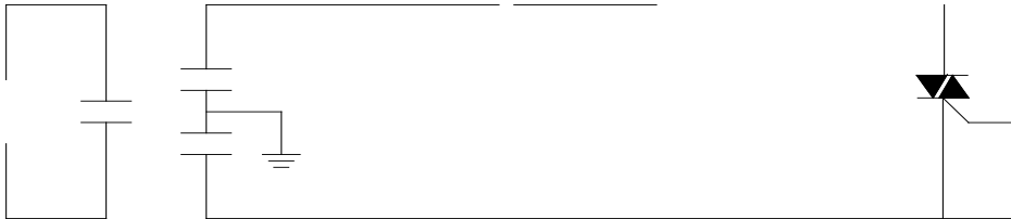
FIG.8 ÖTest circuit for inductive and resistive loads to IEC-61000-4-5 standards