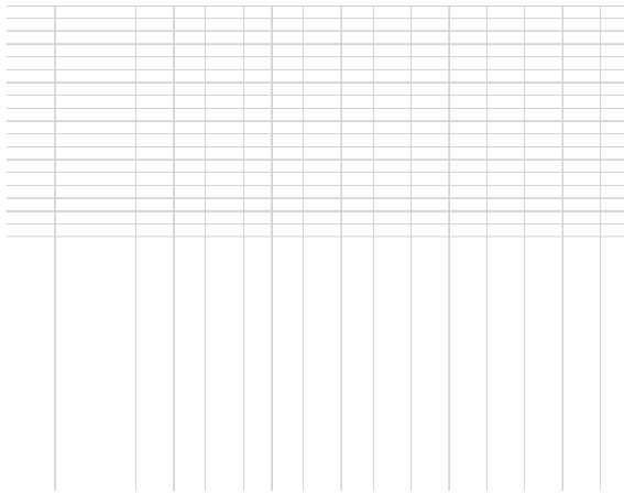
FIG.3: Surge peak on-state current versus number of cycles