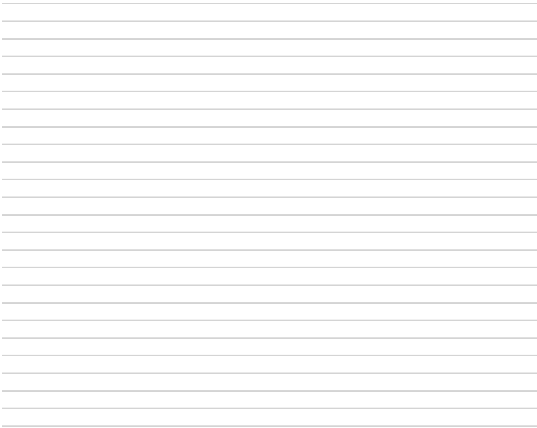
FIG.1: Maximum power dissipation versus RMS on-state current