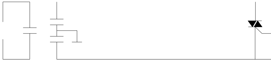
FIG.7 Test circuit for inductive and resistive loads to IEC-61000-4-5 standards