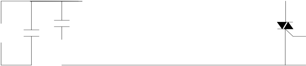
FIG.8 ÖTest circuit for inductive and resistive loads to IEC-61000-4-5 standards