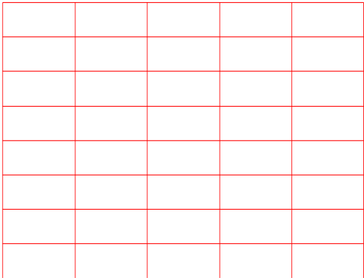
FIG.1: Maximum power dissipation versus RMS on-state current